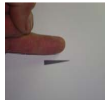
Machined Ecosorb Feedhorn

8030 Fadal and various other machining centers EDM sinker Metal fabrication