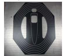
Machined Carbon Panel